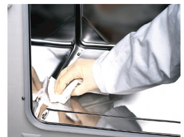
Figure 1: A CO 2 incubator should be easy to clean with minimal handling.